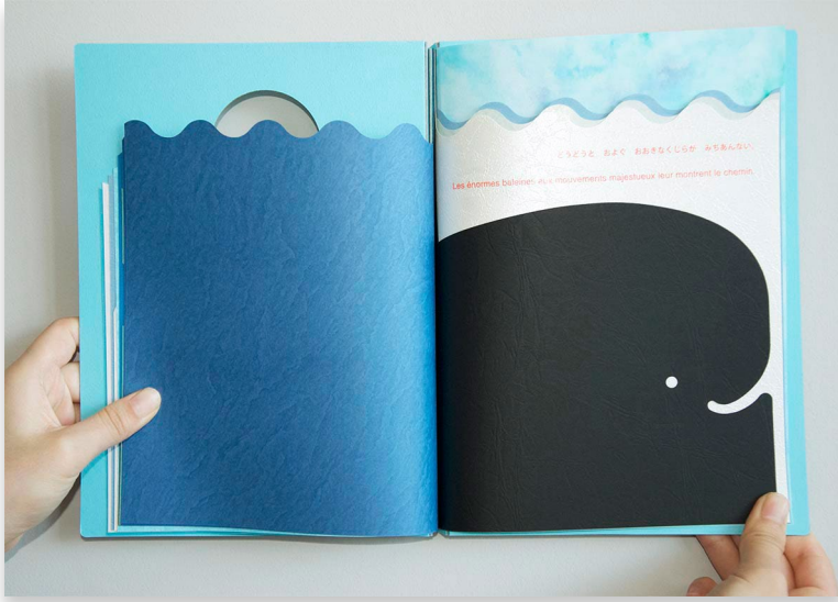
Fig. 5. Blue to Blue , the baby salmon greeted by the whale. Photo by Honglan Huang. © Katsumi Komagata

Sl. 5. Blue to Blue , kit pozdravlja lososiće. Fotografija: Honglan Huang. © Katsumi Komagata