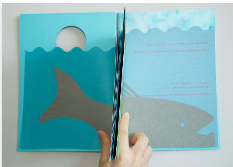
Fig. 9. Blue to Blue , the body of salmon swimming through the gutter. Photo by Honglan Huang. © Katsumi Komagata Sl. 9. Blue to Blue , lososovo tijelo koje pliva kroz pregib u knjizi. Fotografija: Honglan Huang. © Katsumi Komagata