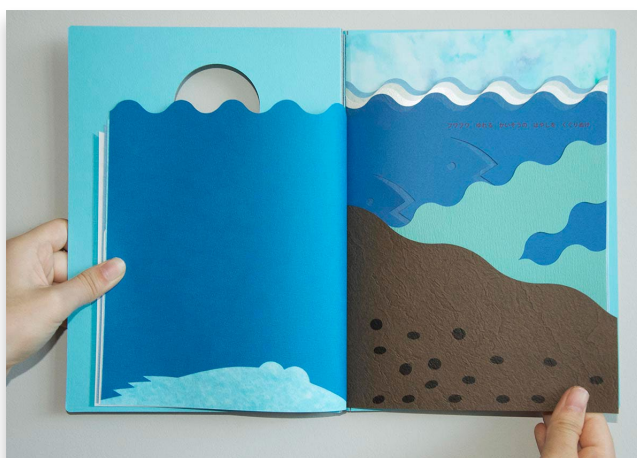
Fig. 4. Blue to Blue , the baby salmon travelling in the seaweed forest.

Very often, however, the stage of the narrative consists of more than one surface. The die-cut within the pages and the pages themselves cut into shapes, create physical depth and allow layers of surfaces to be seen through each other. As the reader turns from one page to another, the scene gradually changes, as if in a stage-like space with movable foreground, middle ground, and background (see Fig. 4).