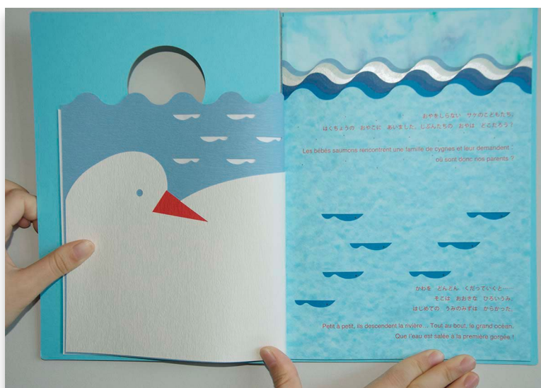
Fig 10. Blue to Blue , mother swan looking at the baby salmon passing by. Photo by Honglan Huang. © Katsumi Komagata Sl. 10. Blue to Blue , majka labudica promatra labudića koji prolazi. Fotografija: Honglan Huang. © Katsumi Komagata