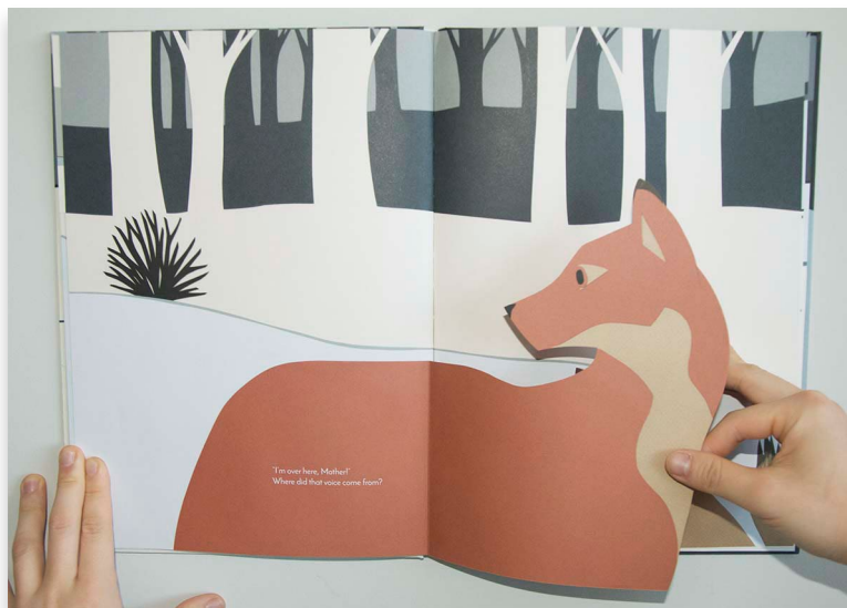
Fig. 12. Maman renard , mother fox looking to the left.

Sl. 12. Maman renard , majka lisica gleda ulijevo.