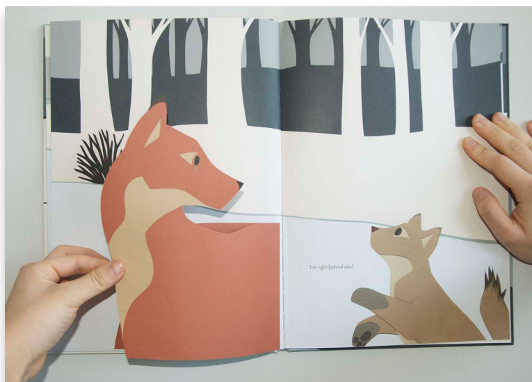
Fig. 13. Maman renard , mother fox turning back.

Sl. 12. Maman renard , majka lisica gleda ulijevo.