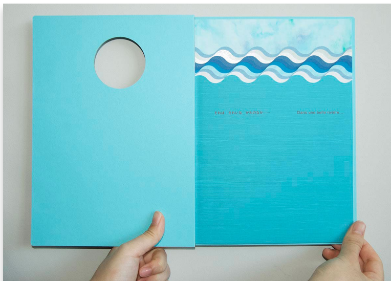
Fig. 1. Blue to Blue , the opening page. © Katsumi Komagata Sl. 1. Blue to Blue , prva stranica. © Katsumi Komagata