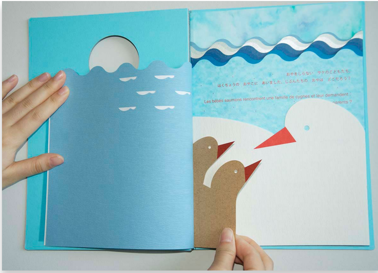
Fig 6. Blue to Blue , baby swans looking at their mother. Photo by Honglan Huang. © Katsumi Komagata

Sl. 6. Blue to Blue , labudići gledaju u svoju majku. Fotografija: Honglan Huang. © Katsumi Komagata