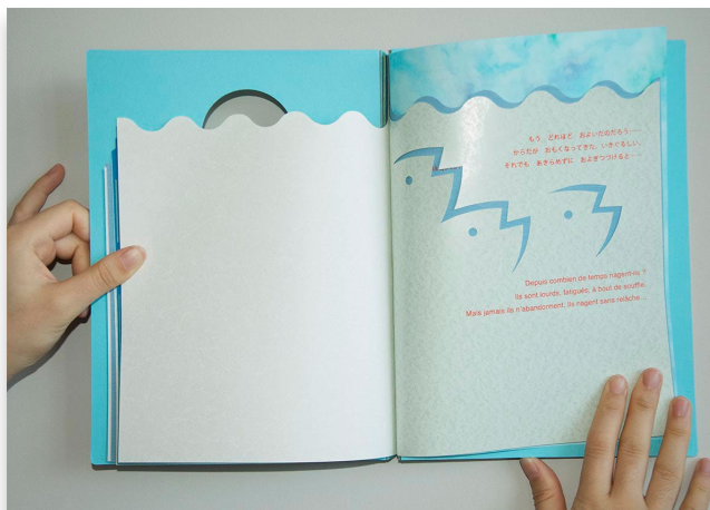
Fig. 3. Blue to Blue , the baby salmon swimming back to the river. Photo by Honglan Huang. © Katsumi Komagata

Sl. 3. Blue to Blue , lososići plivaju natrag u rijeku. Fotografija: Honglan Huang. © Katsumi Komagata