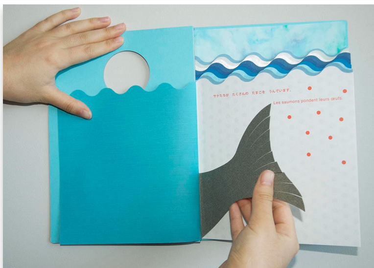
Fig. 2. Blue to Blue , the mother salmon laying eggs. Photo by Honglan Huang. © Katsumi Komagata Sl. 2. Blue to Blue , ženka lososa polaže jaja. Fotografija: Honglan Huang. © Katsumi Komagata