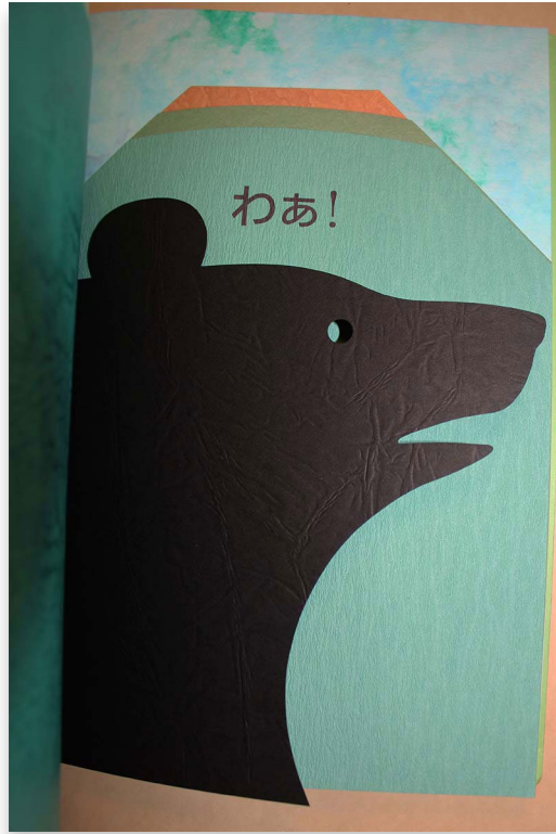
Fig. 7. Green to Green , encounter with the black bear in the deep forest. © Katsumi Komagata

Sl. 7. Green to Green , susret s crnim medvjedom duboko u šumi. Fotografija: Honglan Huang. © Katsumi Komagata