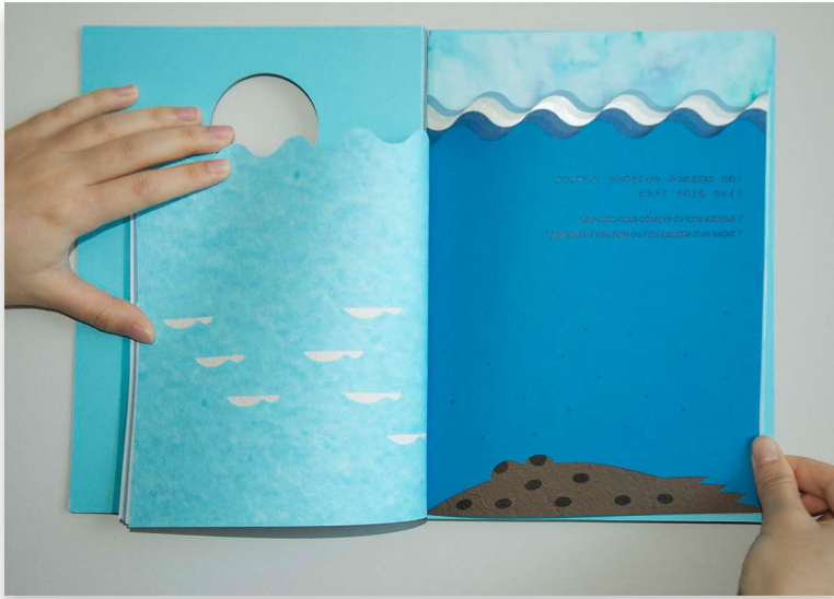
Fig 11. Blue to Blue , the flatfish at the bottom of the sea. © Katsumi Komagata

Sl. 11. Blue to Blue , riba list na dnu mora. © Katsumi Komagata