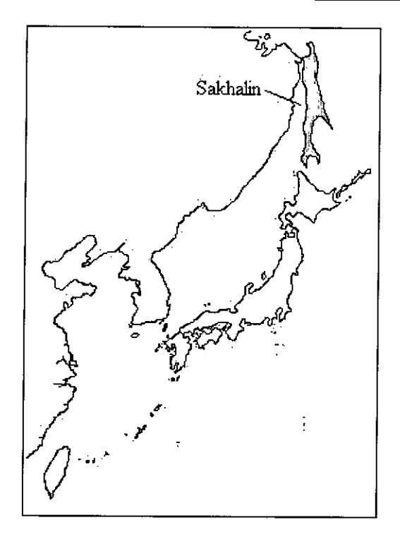
FIGURE 1 Sakhalin Island