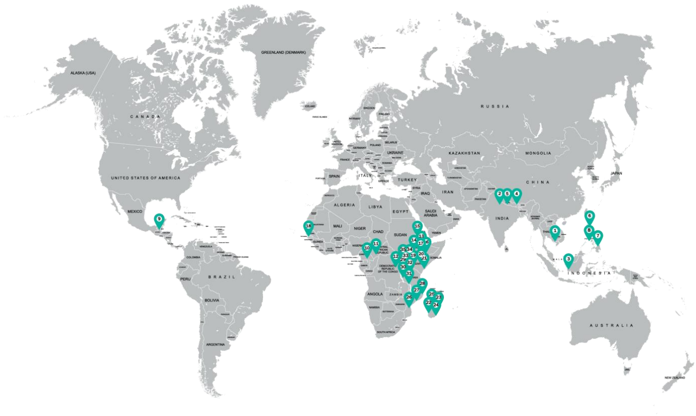
FIGURE 1 LOCATION OF PHE PROJECTS INCLUDED IN REPORT