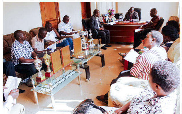
Multi-stakeholder meeting with district officials and CSOs in Gulu

A variety of strategies will be used to foster research utilization, including convening a local Technical Advisory Group to guide the study and interpret the findings. Once finalized, the findings will be presented at in-country and international forums, and through working groups like the Reproductive Health Supplies Coalition's Advocacy and Accountability Working Group and the FP2020 Rights and Empowerment Working Group. Additionally, the findings will be used by the Evidence Project to inform a prospective evaluation study.