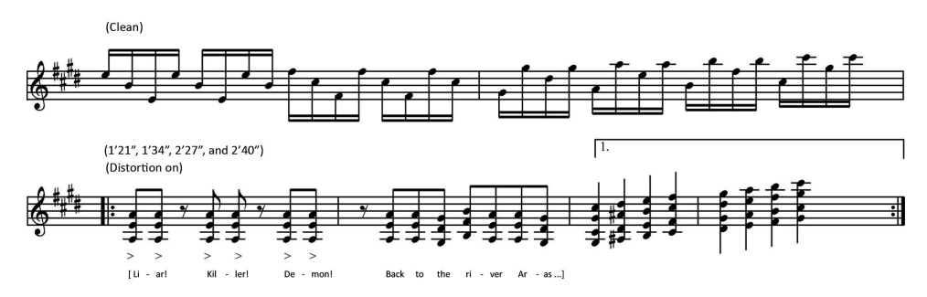
Figure 4: "Holy Mountains," Verse-Chorus (guitar)

Repeated four times throughout the song, the phrase's dramatic effect is further heightened in its final two iterations. In its initial appearances the first measures of the phrase remain rhythmically balanced, mimicking the even syllabic content of the lyrics. In its later appearances the phrase is altered slightly: