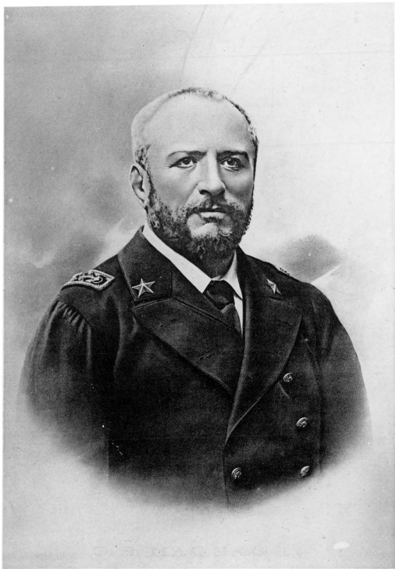
AMMIRAGLIO G. B. MAGNAGHI