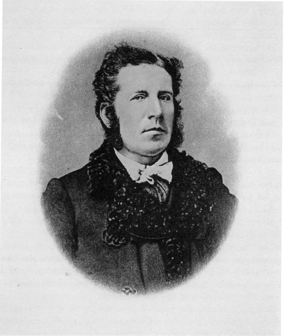
COMANDANTE ANTONIO IMBERT