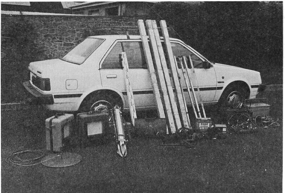
FIG. 2. — Equipment for post-dredging "sweeping" dismantled for transport by car