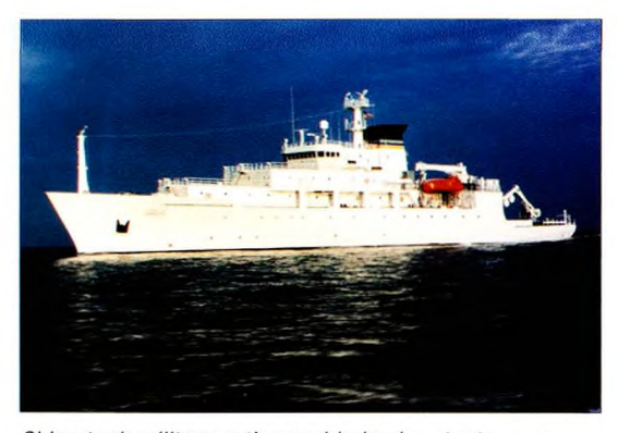
China took military action and lodged protests over 'hydrographic survey' operations by the USNS Bowditch (AGS-21) in China's EEZ in 2000 and again in 2002. Bowditch is one of the seven Oceanographic Survey Ships that are part of the 24 ships in the U.S. Military Sealift Command's Special Mission Ships Program

Military surveys can include oceanographic, marine geological, geophysical, chemical, biological and acoustic data. Equipment used can include fathometers, swath bottom mappers, side scan sonars, bottom grab and coring systems, current meters and profilers. While the means of data collection used in military surveys may sometimes be the same as that used in marine scientific research, information from such activities, regardless of security classification, is intended not for use by the general scientific community, but by the military (Roach and Smith, 1994, p. 248).