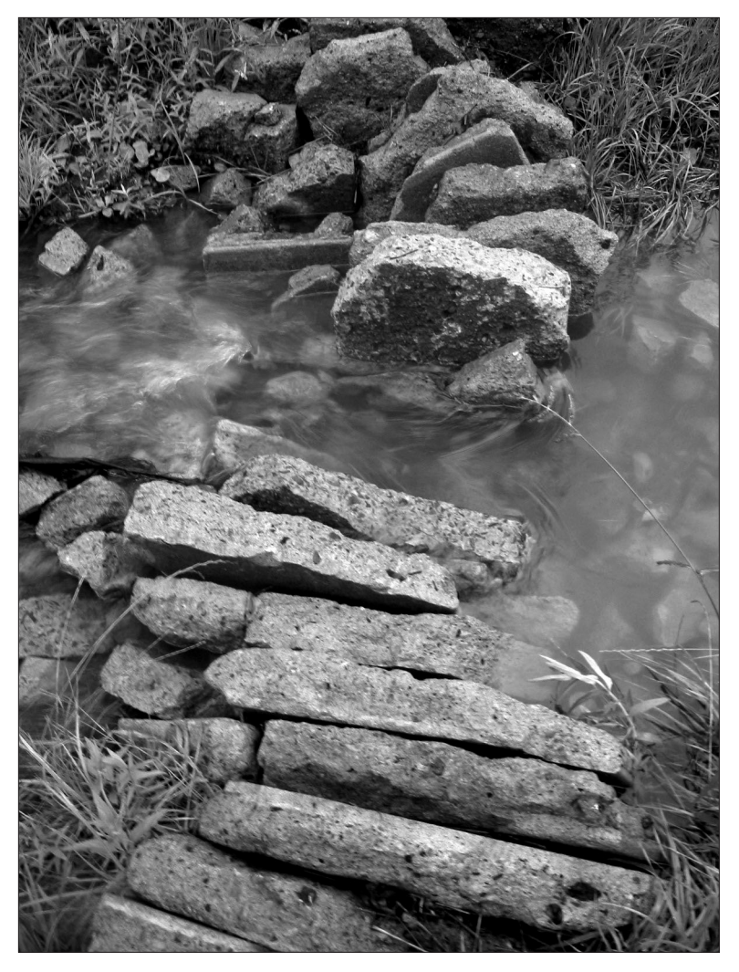
Fig. 7 Demolished grey infrastructure is inverted and reused as stormwater detention weirs.

with reuse's transformation of waste materials into newly re-valued building materials.