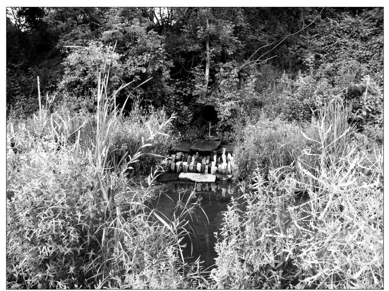
Fig. 1 Part wellspring, part rubble outcrop, Outfall Two at the Willow Patch emerges from the slope as a trickle of waste water and concrete.

45). These strategies often result in a layered, multi-functional integration of infrastructures, buildings, public spaces, and natural areas. On an urban scale these strategies can be used to both capture new spaces for public use in underutilized or infrastructural areas, and integrate redesigned city functions and infrastructures such as waste and stormwater management into public spaces (Berger 2006: 21). From a design perspective, reuse is developed from a cyclical approach to material, an approach that considers the properties of materials and the processes of demolition and reconstruction as part of the design process (Calkins 2009: 96). As a design and construction methodology, reuse realizes physical sustainability benefits by capturing existing embodied energy from the harvest, deconstruction, and/or adaptation of materials from existing structures. And as reuse entails a partial transformation of a previously designed and manufactured element, it in turn recodes public spaces. This recoding activates a simultaneous recovery of previous design elements rendered fragmentary through demolition or deconstruction and an insertion of these signifying elements into a new design language.