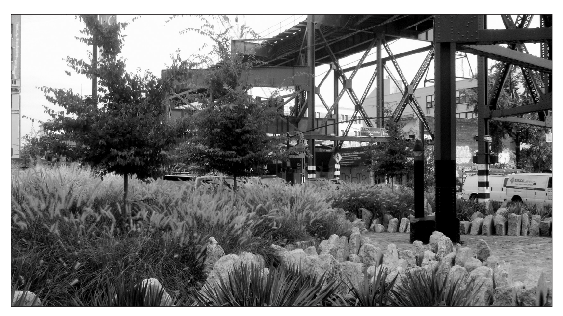
Fig. 11 Urban nature and anthropogenic outcrops of broken concrete rise from beneath the overhead rail lines.

Interpretation derives from the need to "make sense" of the environment and there are various modes of doing so. One is determined by the utilitarian concerns of learning how to navigate or use objects or spaces. The other is more properly interpretive, as it seeks to understand, appreciate, or otherwise feel the ways in which the landscape may mean something. This interpretation is a way to "locate" the landscape within the interconnected trajectories of time, space, and society. Formation and connection narratives explain