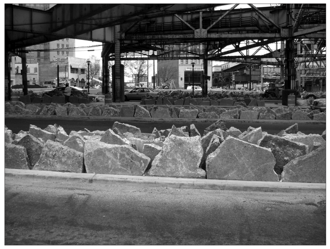
Fig. 12 The functional reuse of waste concrete captures and creates value, while also animating the narrative by exposing marks from previous use and demolition.

indices point to a function, cause, or use that is no longer in existence, the user must use imagination to complete the imbalanced situation with an invented narrative. Imaginative completion by the user is a key to the engaged and unfinished landscape, as the broken narrative requires the participant to become an author or interlocutor. Geographer David Harvey comments on the potential of this kind of individual, localized meaning within the larger social structure: