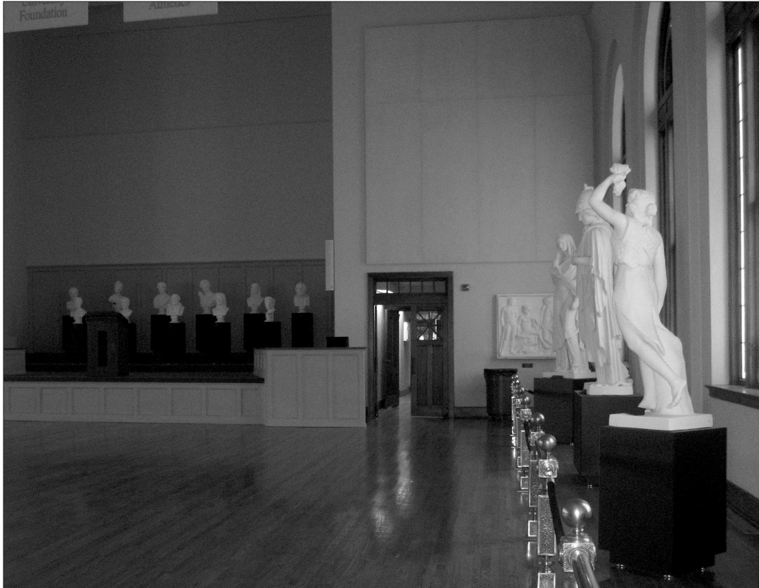
Fig. 6 Plaster casts exhibited in the Barbara Hope Kem Statuary Hall of the Aleen Vogel Wekking Alumni Center at Southeast Missouri State University.

subjects in the NMNH are valued as authentic objects within the context of other reproductions in a natural history museum and have thus been retained.