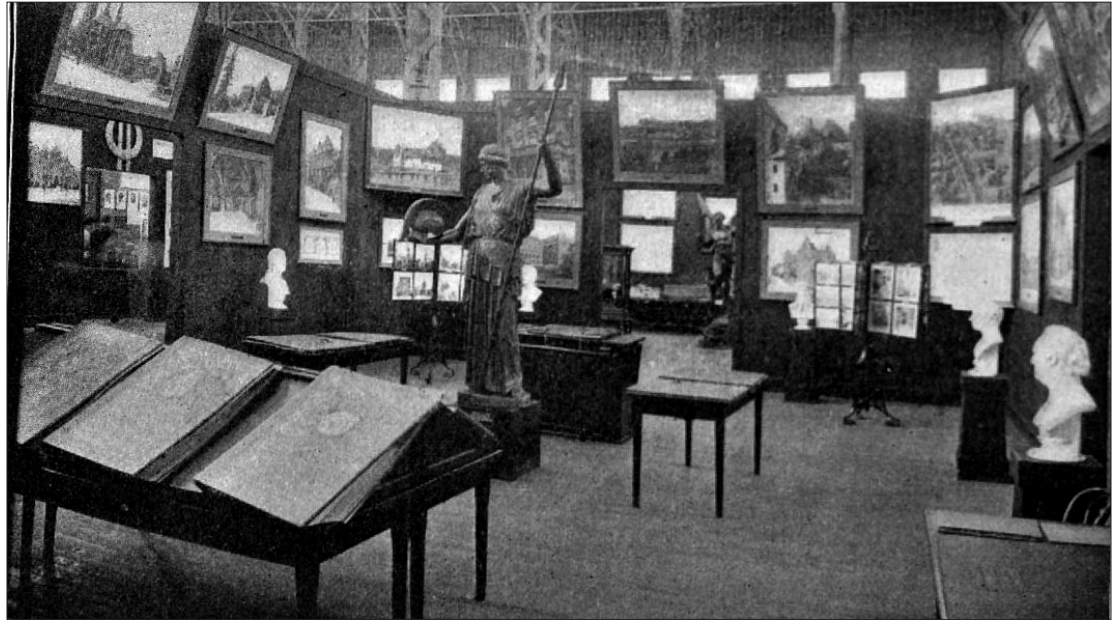
Fig. 2 August Gerber's plaster casts present in the German University exhibit in the Palace of Education. His cast of Athena Lemnia is at the centre of the exhibit with busts of noted Germans around the perimeter (Gerber 1907: 118).

living, of anything from technology to art. In fact, fair buildings, filled with exhibits, were strikingly similar to museums themselves (Harris 1990: 114-20). 2 While the functions of world fairs were multivalent, serving as anything from an anthropological field research station to an imperial dream city, the fair's importance as a locus for didacticism and nationalism will be particularly pertinent for this essay. 3 Indeed, the 1904 Louisiana Purchase Exposition, celebrating the westward expansion of America, took on the central theme of the "University of the Future." The president of the exposition, David R. Francis, believed that fairs should display only the highest products from industry, art, and science (Parezo and Fowler 2007: 19, 32). This essay will investigate how plaster casts at the fair reflected these goals.