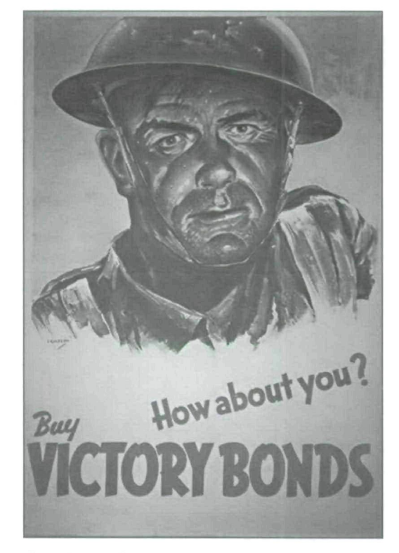
Fig. 7 How about you?...Buy VICTORY BONDS.

disorder and noise of war, the soldier represented here is under attack; his uniform is dirty and torn, his face, clearly visible under his helmet, is twisted into an anxious yet determined grimace, and he is firing furiously. The flag has undergone a similar transformation. While in "Let's Go...CANADA!" the flag is a perfect, unsullied specimen, the Union Jack fluttering bravely above this soldier is tattered and torn. In spite of its ragged condition, however, the flag and the way it is displayed bears a marked resemblance to the standards used in the Crusades. The caption, written in white pseudo-handwriting against the dark foreground also attests to a change in tone and approach. "Can't you See?" it demands almost confrontationally, "You MUST Buy Victory Bonds." The implication is that those on the homefront, in contrast to those who had seen the horrors of war, needed heavy-handed pressure to convince them to contribute. Despite this move to abandon a number of the earlier conceits and to acknowledge some of the realities of war, a number of anomalies in the poster undercut this movement. For example, the tank moving up in the background bears a strong resemblance to tanks used in WW I, not the conflict underway at the time of the campaign. And the soldier himself, although ostensibly portrayed in the middle of an actual battle, is beleaguered, out of position and firing