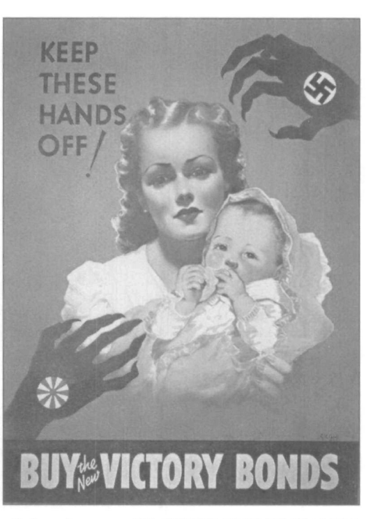
Fig. 2 (far left)

By 1942, these generic appeals to a distant and unreal vision of war had largely disappeared, in part because the government was concerned that "the people did not have a sense of urgency...[and were] not fully aware