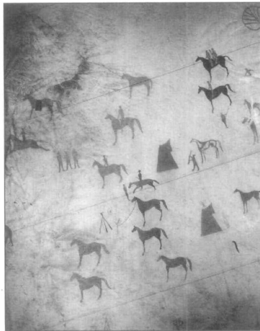
Fig. 1 Section of a Blood tipi painted with pictographs of war exploits.

The Ethnology material is structured very differently. Symbols of success were earned and owned by individuals based on their behaviour on the field of battle. Although the