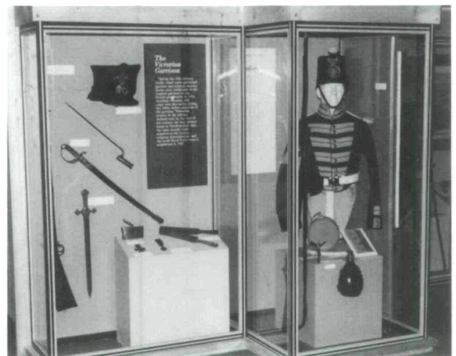
Fig. 2. The Victorian Garrison exhibit.

In the centre of the first gallery are the naval displays