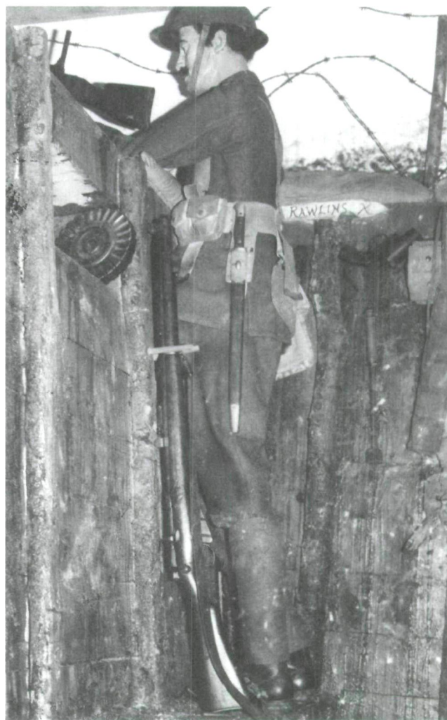
Fig. 3. Part of trench exhibit, First World War.

The second gallery covers the twentieth-century wars and follows logically out of the military displays in the first gallery. The widening scale of war, its incredible destructiveness, its broader impact on the lives of Newfoundlanders are all underscored in this section of the museum. For the twentieth-century period, the wealth of resource material available allows for a more interpretative presentation of Newfoundlanders at war. For example, at the entrance to this gallery, set against a backdrop of the Somme battleground, is a cutaway of a First World War trench. A lone soldier of the Newfoundland Regiment stands guard against an invisible enemy while in an adjoining bunker an officer, momentarily diverted from the business of war, cleans his pistol. The art of the museum technical staff in capturing some of the realism of life in the trench has been expertly put to use in this display. For Newfoundlanders it is a reminder of the tremendous sacrifice made by a young generation on the fateful battlefields of Gallipoli, the Somme, Beaumont Hamel and Bailleul. Elsewhere, the displays cover other aspects of the war – recruitment and mobilization, the patriotic effort at home, chemical warfare, in which a Newfoundland doctor was to play a prominent role in devising protective masks, and the war in the air. Because