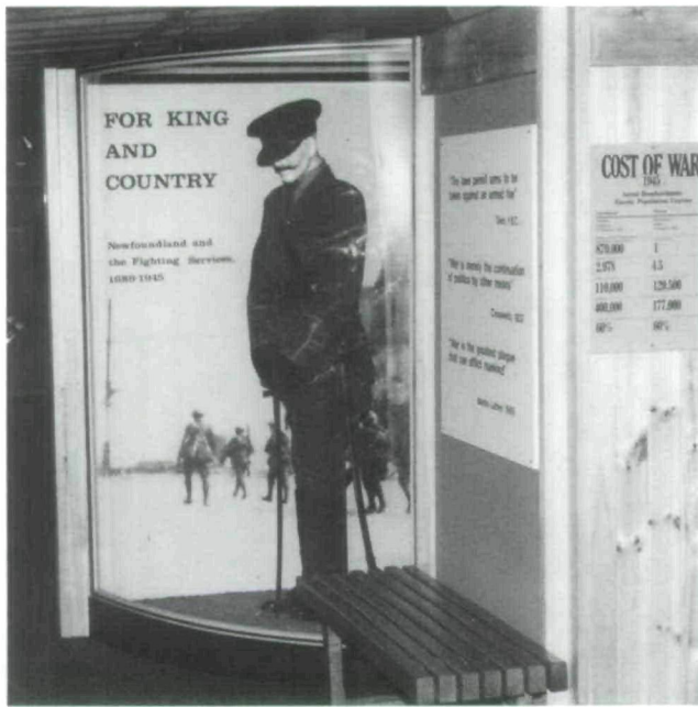
Fig. 1. Introduction to the exhibit.

Museum seeks to recount Newfoundland's and Newfoundlanders' involvement in war and with the fighting services in the period from 1689 to 1945 while underscoring the terrible cost of that involvement to the island and its people. Beside each of the major displays, the "Cost of War" reminds the viewer that patriotism, however commendable and however justified by the circumstances, can be a heavy burden. Witness the cost of the First World War to Newfoundland, where on 1 July 1916 at Beaumont Hamel the Newfoundland Regiment was nearly wiped out, suffering 710 casualties out of a total force of 770. To this day, 1 July is a day of mourning in Newfoundland. Of the first contingent, the famous Blue Puttees, 445 were killed or wounded out of the 537 sent overseas. There was not a street in St. John's that escaped the loss of family member or friend in that war.