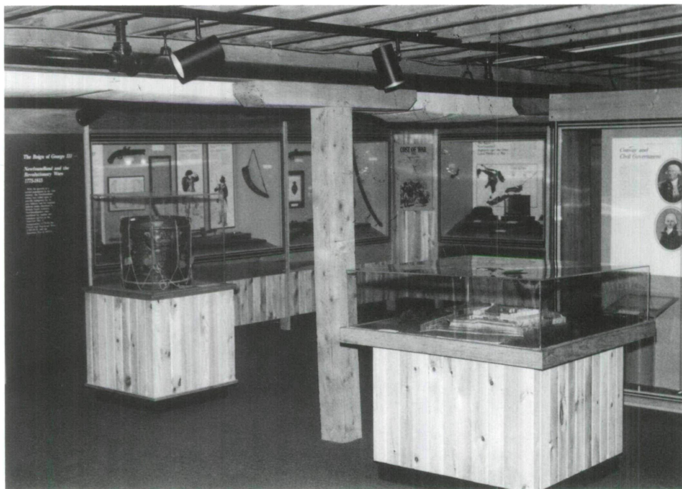
Fig. 5. Overview of first gallery.

The Victorian section contains some important rare artifacts dating from the early nineteenth-century local regular units, as well as other items from their auxiliary support, the recreational volunteer corps. A display on the turn-of-the-century local naval reserve force (one of the very few such units at the time outside the British Isles) indicates some of the features of naval training and preparedness required in an age of transition from sailing to sophisticated steam-powered warships. Technologically, a graphic display highlights the nineteenth-century revolution in firepower for both small and large calibre weapons. From flintlock, through percussion, to cartridge fire, the development is traced from black-powder smooth-bore weapons to the smokeless magazine rifle, quick-firing artillery and the machine gun. In preparation