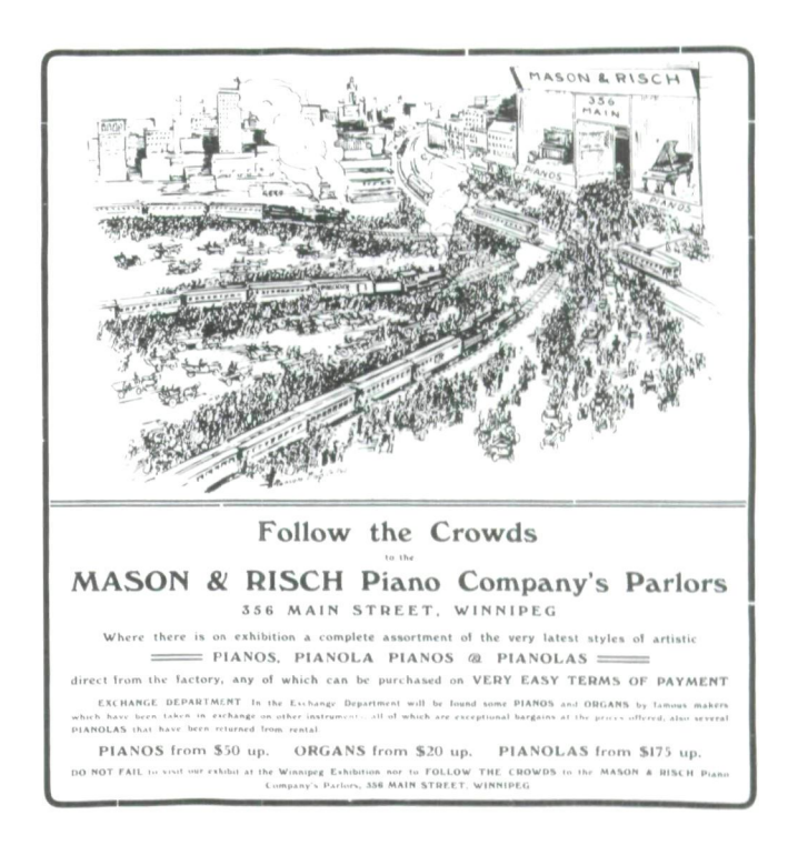
Fig. 8. Truth in advertising, or just wishful thinking? It seems that all the world converged at the door of Mason & Risch Piano Company, Winnipeg, during the 1906 exhibition season.

between the average piano and the Karn merely creates distinction, not regality, which is inherent." 38