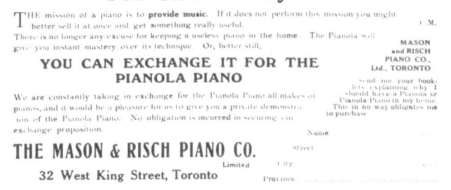
Fig. 9. Despite convincing ads such as this, the demand for the piano companies' automatic musical instruments was soon overshadowed by the popularity of the phonograph. The "Pianola Piano" was made by Weber of New York.