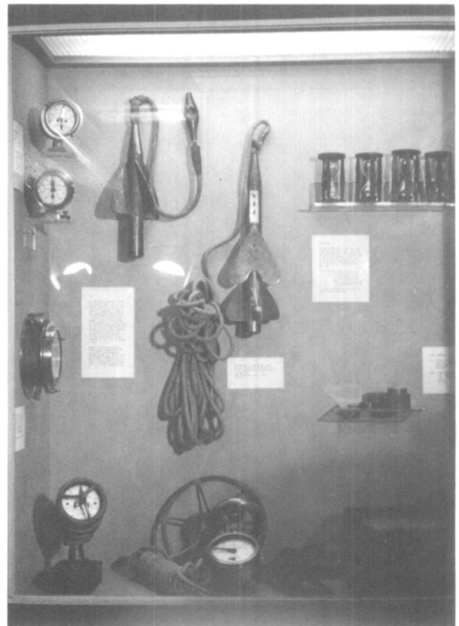
Fig. 1. Display case in the "Navigation" section.

It is an excellent idea to place a museum in a downtown shopping area which is itself part of the city's heritage: it becomes immediately accessible to the "passing trade," as shopkeepers say, rather than an institution demanding a special visit. The museum's designers have taken this into account in planning the first floor, making it open and attractive to those walking by. It is a pity that it is not more extensive. Casual visitors may be deterred from browsing any further by the stairs which lead, via a temporary exhibition on Elizabethan England (which will be replaced by a permanent natural history display) to "Ships