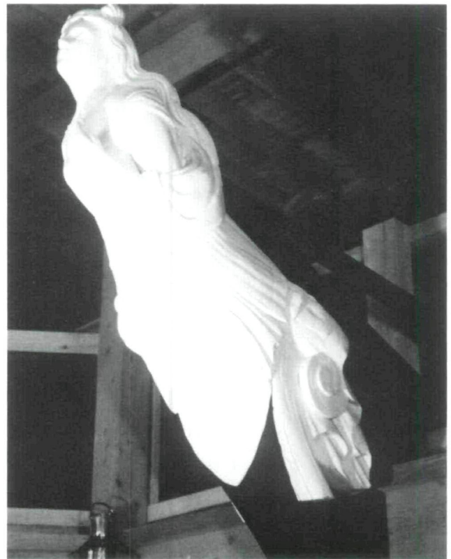
Fig. 3. Figurehead of the Thetis .

Nevertheless, there are three sections of the display which are arguably anomalous. One has been mentioned already: the Red Bay Basque material. The section itself is clear and well-done, but it has little to do with Newfoundland trade and shipping. It deals with the exploitation of a single resource by European fishermen in a finite and early period. However, it was necessary that the material be made available, and this was the only possible location. Likewise, the section on the seal fishery fits uneasily. Sealing had a lot to do with shipping, and that aspect is emphasized — the display is dominated by models of the Bonaventure and Adventure , bought for the fishery in the early twentieth century — but since it was, like the cod fishery, a resource industry, it should be elsewhere. Indeed, one hopes that in time the museum will find the space and the money to provide a fitting memorial to an ancient industry hit on the head and left to die by a militant and ill-informed animal rights movement. The collection of navigational instruments, complete with a