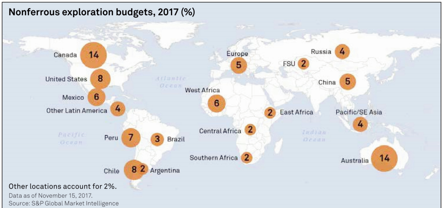
Figure 2. The global distribution of exploration expenditures for nonferrous metals in 2017, as compiled by S & P Market Intelligence (2018).

ry approvals system. For example, a mine development proposal can require over 200 approvals after a multi-year environmental assessment process. It is important to note that environmental assessment was at one time limited to a planning process intended to provide guidance for the issuance of licenses and was required only for projects that received federal funding. In today's world, approvals of mine development projects from start to finish (including both environmental assessment and subsequent regulatory approvals) can take at a minimum 3 years, and many require more than 10 years.