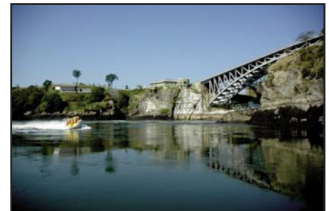
Figure 2. Terrane contact at the Reversing Rapids. Light grey marble of the Neoproterozoic Green Head Group (Brookville Terrane) below the bridge and dark grey shales of the Cambrian-Ordovician Saint John Group (Caledonia Terrane) downriver.

wards. The gorge at Reversing Rapids was visited by Charles Lyell in 1852 where he marvelled at the tidal phenomenon and visited the graphite mines that were then following seams in the Precambrian marble. Not far