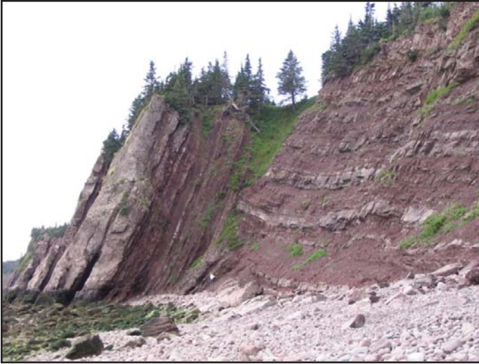
Figure 3. Megafan deposits of the Upper Carboniferous Tynemouth Creek Formation on the Bay of Fundy shoreline.