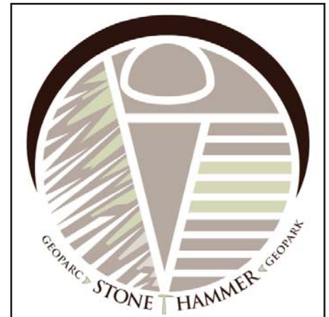
Figure 1. Stonehammer Geopark recognizes its history of geological and palaeontological exploration.

This trip will visit the Precambrian and Cambrian terrane contact at the Reversing Rapids (Fig. 2), a site better known for high tides of the Bay of Fundy that push the river back-