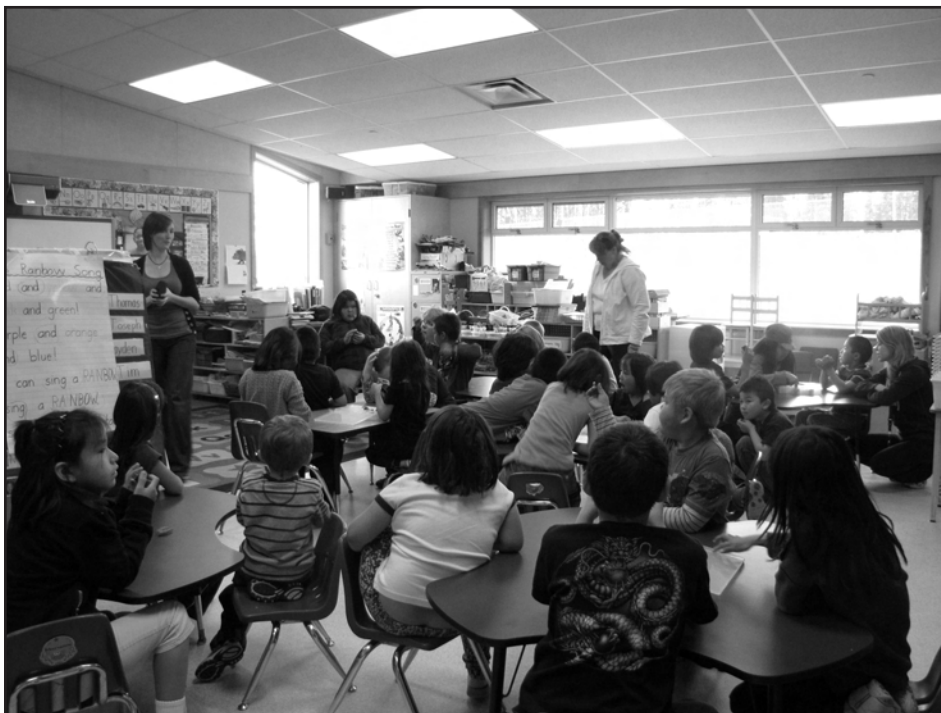
Figure 2. University of Victoria undergraduates engaging with students in classroom presentations.

Quesnel (3), Smithers (4), Cranbrook (19), Williams Lake (14), Vanderhoof (4), Fraser Lake (5), Burns Lake (5), Houston (7), Terrace (5), and Prince Rupert (5). A total of 127 presentations were delivered, in 44 schools, to 2615 students.