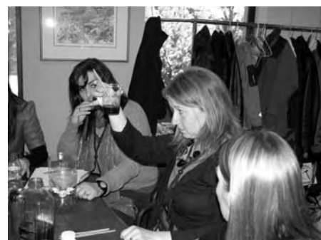
Figure 3. Teachers working on the water filtration activity.