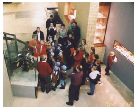
Figure 4. Beaver Group visit.

A popular hands-on activity is the fossil-fish dig. This involves using dental picks to carefully excavate fossil fish,