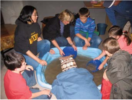
Figure 5. Gold panning at the University of Waterloo Gem Show.