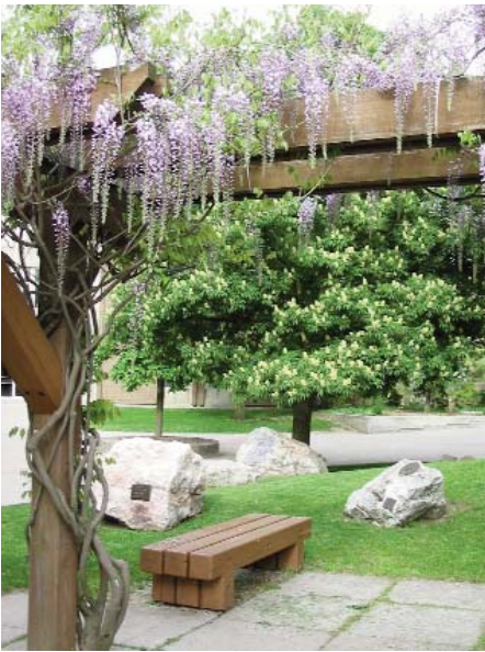
Figure 6. Peter Russell Rock Garden.

very large, ranging from 50 kg to 5 tonnes, and cover a vast span of geological history, from an Archean banded iron-formation boulder from Timiskaming, ON, to quartzite from Desbarats, ON that exhibits striae engraved by a Pleistocene glacier. The rock garden is also a popular spot for faculty, staff and student lunches and coffee breaks, allowing informal learning to take place.