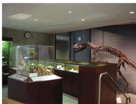
Figure 3. The Conestoga Rovers Learning Centre.