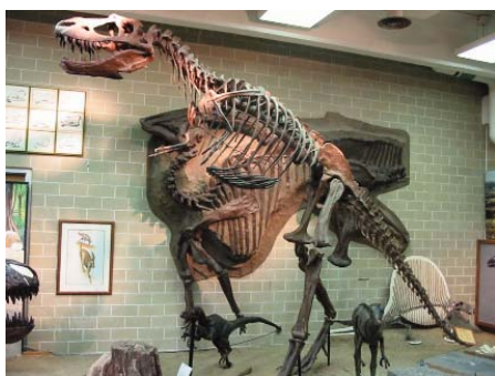
Figure 1. The Earth Sciences Museum before moving to the new space in 2003.

23 donated specimens representing various Ontario geological formations. It was renamed The Peter Russell Rock Garden , in honour of the museum's curator, in 1999, and now contains over 50 specimens from all over Canada and parts of the United States.