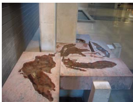
Figure 2. Great Lakes Fountain in the March Networks Exhibit Atrium.

The building's atrium is open seven days a week and houses many exhibits, including a replica Tyrannosaurus rex skull, a wall-mounted reproduction Parasaurolophus skeleton, various mineral exhibits, and an 8.5 x 1.52 x 0.53 m, 1.2-billion-year-old granite gneiss monolith from the Allstone Quarry in Northern Ontario. There is also a gneiss fountain, which is a schematic representation of water flow through the Great Lakes (Fig. 2). A gallery located adjacent to the atrium (Fig. 3) is the venue for talks to visiting groups and houses more exhibits, such as a replica Albertosaurus skeleton, an original cave bear skeleton, and a diorama recreating the environment represented in the Cambrian Burgess Shale in British Columbia. This space is open during regular university business hours.