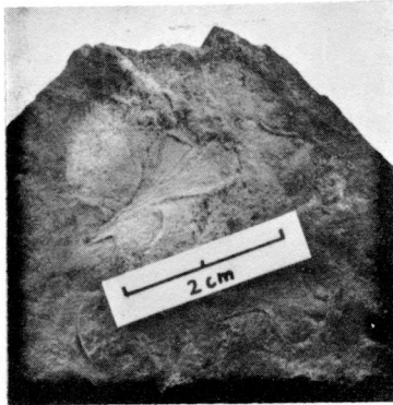
Figure 1. Barren pinnules of Archaeopteris sp.