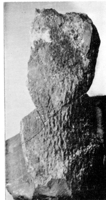
Figure 4. Decorticated trunk of Cyclostigma sp. One half natural size.