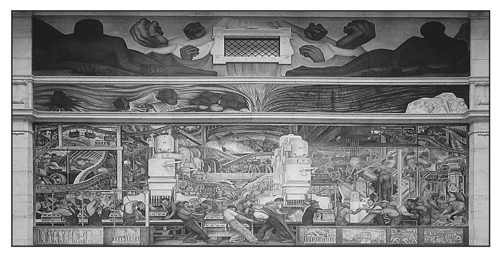
Figure 3: Diego Rivera's masterpiece of industrial modernity, Detroit Industry , 1933.

modern finance, advertising marketing, branding, and sales and distribution networks. The effect of these sprawling, bureaucratic corporations was no less than a re-ordering of the market as well as the birth of entirely new notions of consumption and production.<sup>24</sup> Moreover, the social impact of the car was tremendous, reshaping and remaking everyday life by impacting issues as diverse as traffic, work, pollution, sex, city-design, home-building, accidents, travel, and even the rituals of birth, marriage, and death (to name but a few).<sup>25</sup>