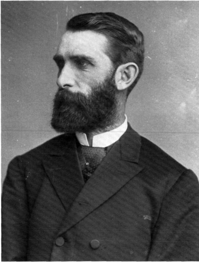
Figure One: Josiah Wood, MP, 1883

tions totalling $50,000 he was by far the railway's largest backer. 63