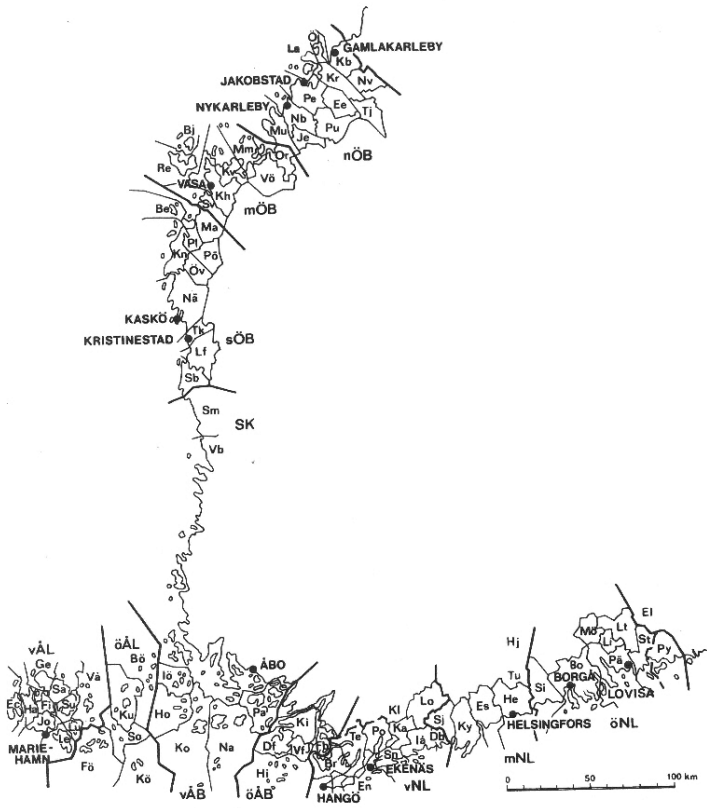
Figure 2: The Swedish-speaking area in Finland. sOB = South Ostrobothnia. From Gullmets-Wik (2004)