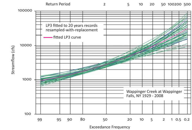
Figure 1. Results of sampling 20-year records from the distribution described by the solid central curve, and fitting a log-Pearson 3 distribution to the data.

The examples in Figures 1 and 2 show that we should be modest in our claims of what we understand flood risk to be now. Cohn and Lins in [2] point out that if we incorporate long-term persistence into our analysis, our flood risk estimates appear even less precise. Furthermore, spatial correla-