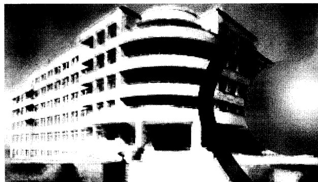
SANTA CRUZ HOSPITAL, in Sao Paulo city.

The reason for deciding to be a ST professional is to create a better understanding of communication disorders in geo-political-socio-cultural contexts.