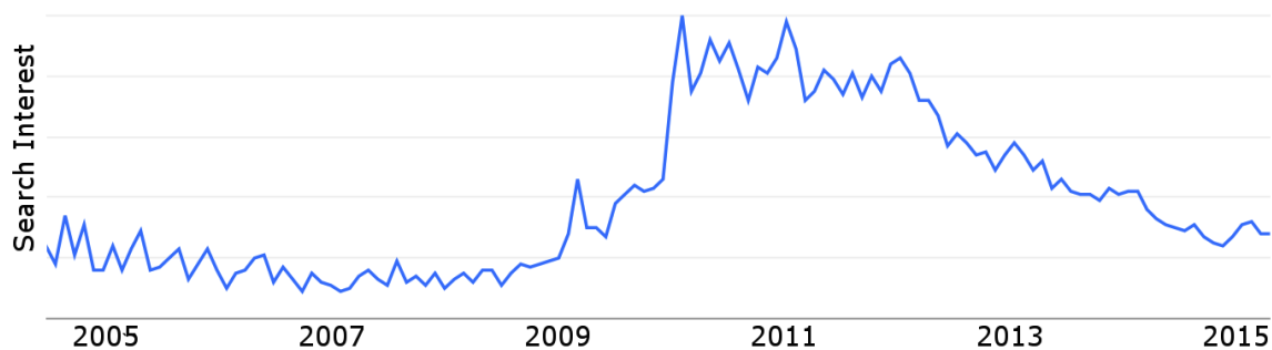
Figure 1. Google Trends results for "Stereoscopic 3D". Vertical-axis is search interest normalized by Google.

That inconsistent pattern of public interest continues today as blockbuster movies such as 2009's Avatar , currently the highest grossing film of all time, reignited tremendous interest which now shows signs of declining. A normalized plot of Google search activity for "stereoscopic 3D" shows interest initially driven by Avatar and then fading (Figure 1). Further evidence suggests that today's resurgence of 3D films may be another fad as sales of 3D film tickets have declined four years in a row in total revenue and seven years in a row in percentage of overall ticket sales (Lieberman, 2014), and sales of stereoscopic home theater systems have fallen below industry expectations (Dash, 2013).