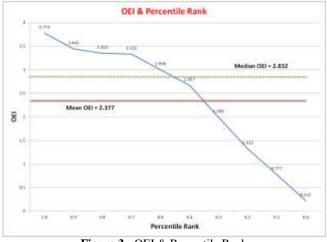
Figure 3 - OEI & Percentile Rank