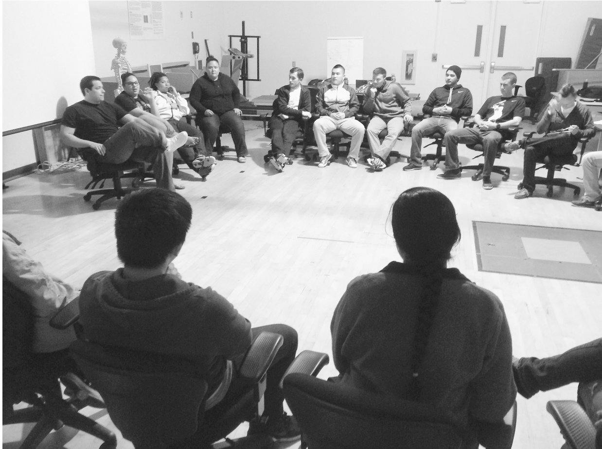
Figure 2. Students engaged in peer-review formative assessment of oral communication following group presentations during laboratory session. Each student group was responsible to assess another group based on the customized oral communication rubric (Table 1).