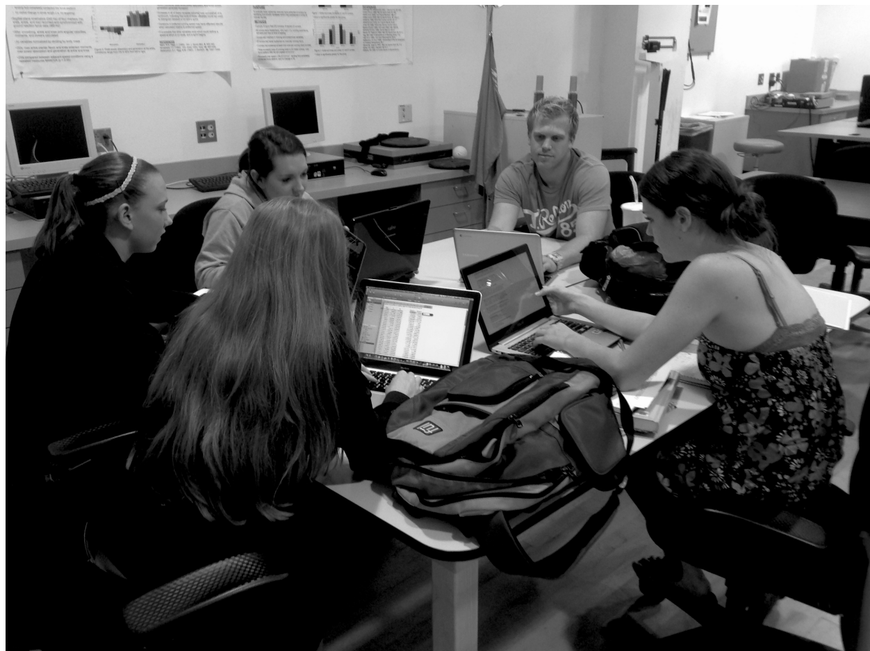
Figure 4. Students engaged in the socialization phase of knowledge creation during face-to-face exchange of ideas during laboratory session. Students chose an open ended clinical problem from a menu of options and then developed division of labor and an initial strategy to accomplish the problem solving technique described in Figure 1.

Although PBL students showed significant gains in oral communication competency, the need to engage students in a progression of competence development across a collaborative learning curriculum becomes important to avoid a receding of the ability prior to graduation. Thus, the onus lies on the educator to design learning environments which progressively incorporate prior learning and competency development via curricula which emphasize peer-review formative assessments rather than summative assessments (Frank, 2010). This becomes especially important as the understanding of health care competency is redefined from content knowledge mastery to the ability to collaboratively manage ambiguous real world problems while communicating remotely (Epstein & Hundert, 2002). Thus, while we have made a commitment to developing problem based learning environments as well as a novel assessment tool of oral communication competency; without a continuum of competency development across a curriculum, it is unknown if these gains will persist following graduation.