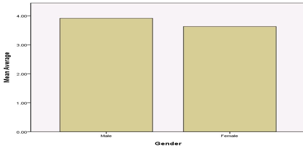
Figure 3. Average satisfaction with statistics online courses by gender

In Figure 2, it shows the number of years that the participants have in teaching. All of the participants have had a number of years teaching face-to-face and online. In addition, it illustrates in Figure 2 that the participants who had teaching experience of 6 to 10 years were a little more satisfied with taking the statistics course online followed by 0 to 5 years, 16-20, and 11-15. No students under the age of 21 participated in this study.