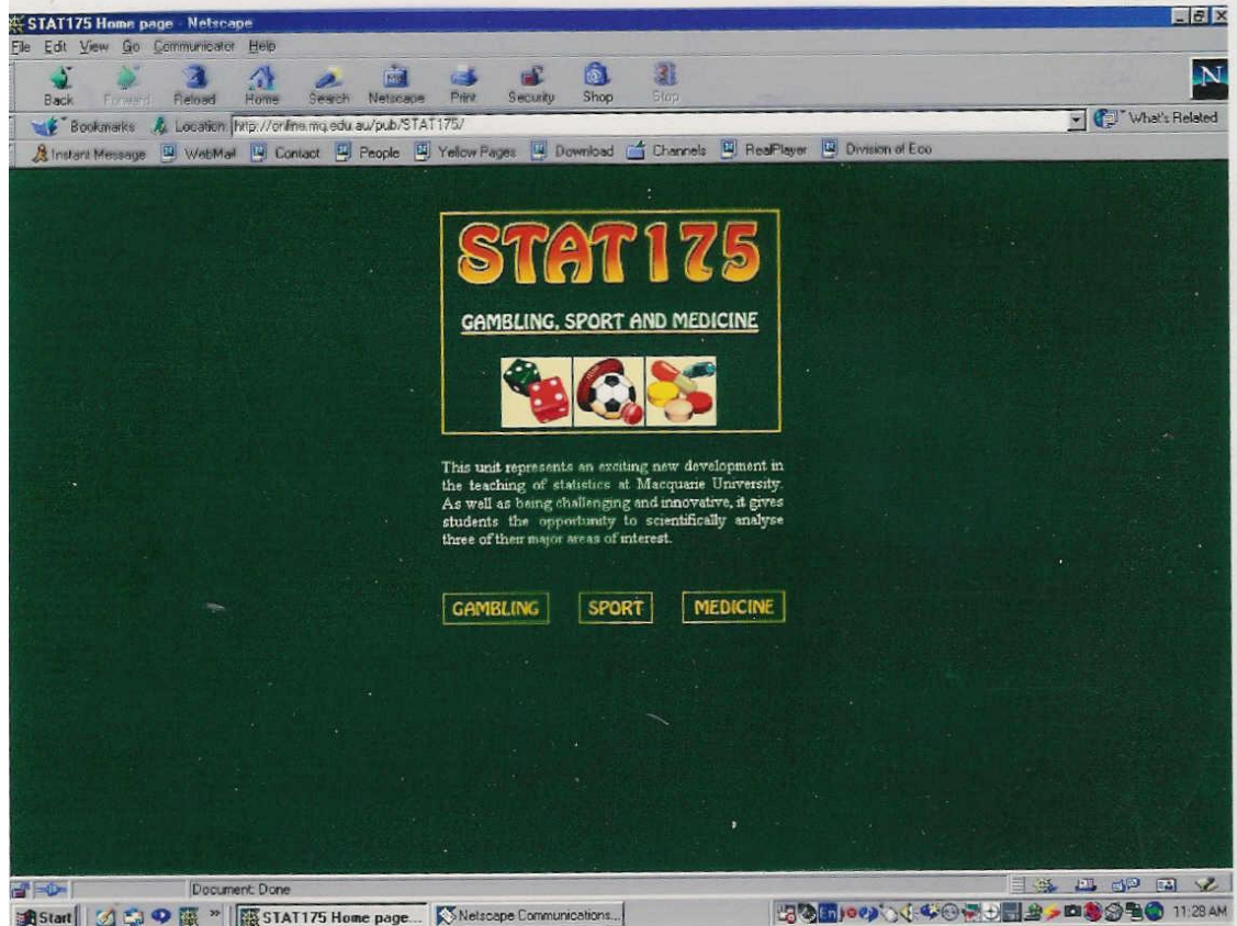
Figure 1: The opening screen of the public section of the website for Gambling, Sport and Medicine

The Olympic Games in 2000 and 2004 provided a golden opportunity to demonstrate statistical techniques using sporting data. In particular, one lively topic of discussion was the times and distances that athletes and swimmers would have to achieve in order to win a gold medal. With an abundance of historical data, students were able to use their statistical skills to come up with various intervals within which they feel the winning performance would lie. Then they could compare their answers with what actually happened.