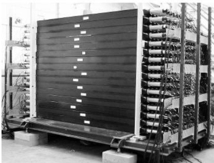
Figure 2: The MoNA detector array in its current configuration

The MoNA detector is shown in Figure 2. It consists of 144 individual bars of clear plastic scintillating material. The bars are stacked 16 high and 9 deep to form a large array. Each bar measures 10×10 cm 2 and is 2 m wide. The ends of each detector bar are equipped with photo-multipliers that are able to detect the faint scintillation light, convert the light to an electrical signal, and amplify its intensity by a factor of 30 million. The MoNA electronics enables us to determine within a few centimeters the position of the light emission along the bar. This is done by measuring the time difference of the signals arriving at the left and right photo-multipliers. This time difference has to be known to within 250 picoseconds. With this precise timing information, we also can calculate the velocity of the neutrons by their flight time from the target to the detector. Detailed descriptions of the construction and capabilities of the MoNA detector have been published (Luther et al., 2003 and Baumann et al., 2005).