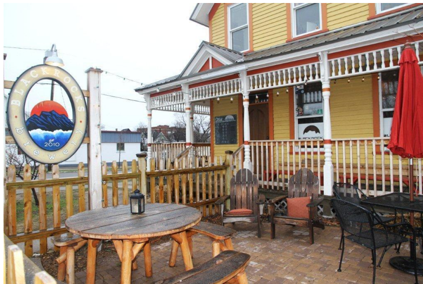
Figure 1: Blackrocks, 424 N. Third Street

The business evolved around a friendship and a mutual interest (avocation) of craft beer. This hobby grew into the idea of a business, and in 2010 they opened to the public in an old, private residence (zoned business by 2010) at 424 N. Third Street in Marquette, Michigan (see Figure 1). They were able to buy the building, giving up a small interest in their business.