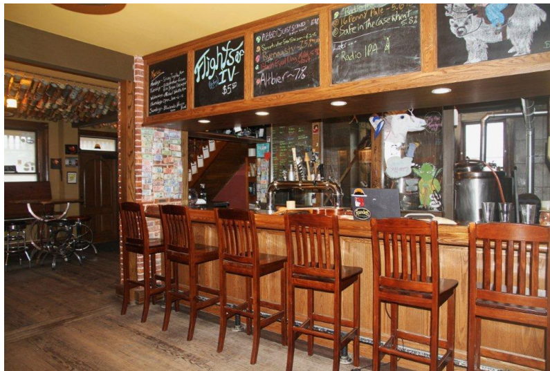
Figure 2: Blackrocks Bar Photo by M. Vroman, 2013

The ambience of Blackrocks was “fun and good times.” Its physical setting was rustic. The hardwood oak floors creaked, as did the stairs to the second floor. The bar was an old, aged-oak structure that had seen extensive use by customers and lots of spilled beer (see Figure 2). In the spring of 2013, Andy and David planned to renovate the second floor to accommodate an additional 50 people. When finished, the legal capacity was 100 people (1,200 sq. ft.). There was a porch around the building which served as overflow when temperatures reached over 40 degrees (outdoor heat lamps were prevalent) and in the summer and fall periods. Seating capacity was limited to about 15 so the rest of the patrons stood.