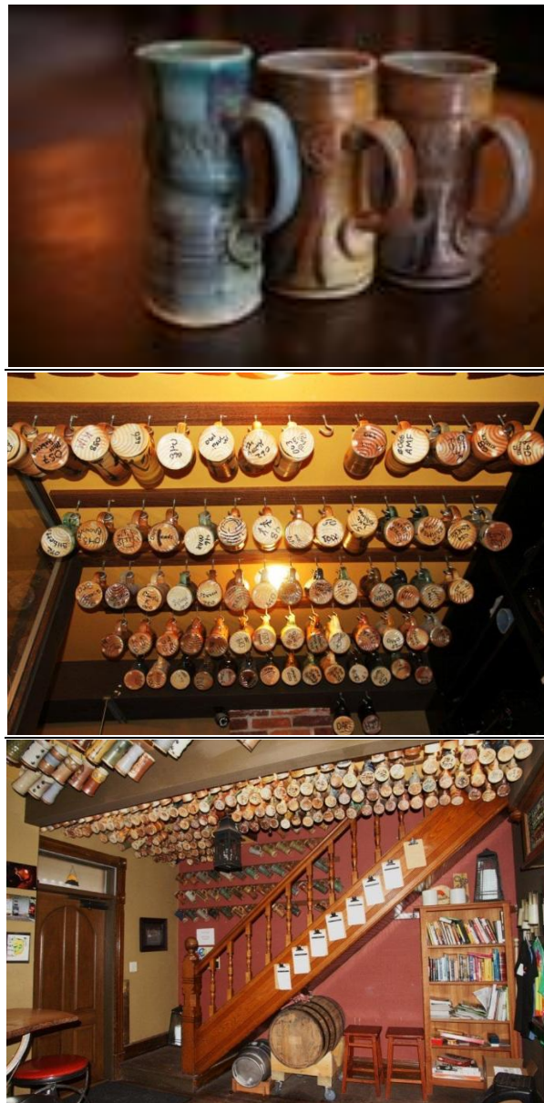
Figure 3: The Mugs of Blackrocks