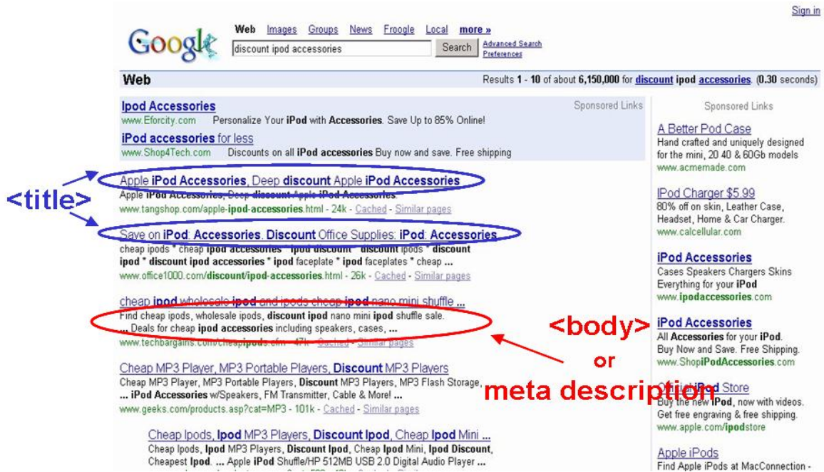
EXHIBIT 3: Use of Meta Tags in Organic Search Listings