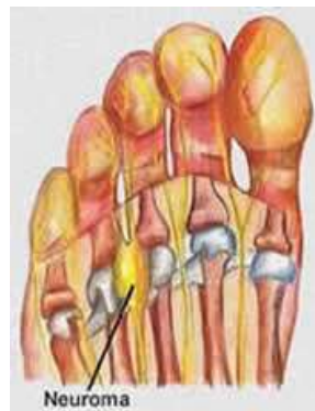
Figure 5 Morton's Neuroma (Hughes, etc. 2007)

According to Prentice, Morton's Neuroma (Figure 5) usually takes place between the heads of the third and fourth metatarsal and is the most frequent nerve problem of the lower extremity. The above location is where the nerve is the thickest; therefore, it receives branches from both the medial and lateral plantar nerves. (Prentice 2006) A neuroma is a mass that occurs in relation to the nerve sheath of the common plantar nerve at the point at which it separates into the two digital branches of the adjacent toes. The characteristics of this injury includes the inability of the great toe to dorsiflex, severe pain starting from the distal metatarsal head that spreads to the tips of the toes, and a burning numbness between or in the toes. (Prentice and Arnheim 2005) In addition to the above symptoms, the collapse of the transverse arch may irritate the injury by stretching the transverse metatarsal ligaments and compressing the common digital nerve or vessels. (Prentice 2006)