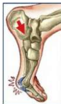
Figure 6 Turf Toe (Sports Injuries 2007)

Turf toe (Figure 6) is a hyperextension injury, which results in a sprain to the metatarsophalangeal joint of the great toe commonly known as the "big toe". This type of injury may result from repetitive overuse or by a specific trauma to the foot. (Prentice 2006) The most common mechanism that causes turf toe is the application of a downward force. Turf toe accounts for more than eighty percent of toe injuries. Turf toe causes the great toe to become dorsiflexed beyond biomechanical limits; resulting in a tear of the capsule. An athlete with turf toe may experience a significant amount of pain and swelling around the injured joint. (Prentice 2006) As stated by the staff at the Orthopedic Institute, the pain occurs at the metatarsophalangeal joint where the big toe attaches to the foot. The magnitude of pain increases when the athlete pushes off on the injured foot. Pain may occur when the foot is moved in extension, or when running or jumping. (Orthopedic Institute 2006)