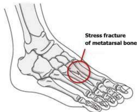
Figure 2 Stress Fracture (Prentice and Arheim 2005)

Metatarsal stress fractures (Figure 2) are common foot injuries that occur most frequently in running and jumping sports. Overuse is the primary cause of stress fractures. According to Prentice and Arnheim, this injury commonly occurs because of structural deformities in the foot, changes in training surfaces, training errors, or wearing inappropriate shoes. (Prentice and Arheim 2005) Additional causes may include a sudden change in training patterns, running hills, running on hard surfaces, or increasing the amount of mileage the athlete runs. As stated by Prentice, the most common type of metatarsal stress fracture involves an injury to the shaft of the second metatarsal. The March Fracture is another name for Stress fractures (as in soldiers marching). Athletes that suffer from conditions such as flat foot, structural foot vargus, hallux valgus, or a short first metatarsal may be at an increased risk for this type of injury. Another frequently seen stress fracture affects the fifth metatarsal and takes place at the intersection of the peroneus brevis tendon. The athlete typically complains of tenderness along the bone in the midfoot. (Prentice 2006)