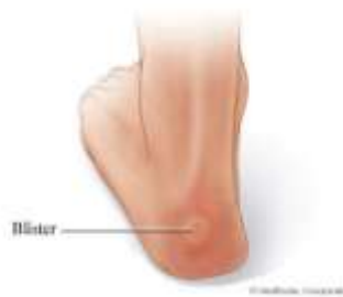
Figure 3 Blisters (Green & Murray 2007)