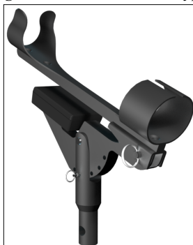
Figure 6. Got1Holder Prototype