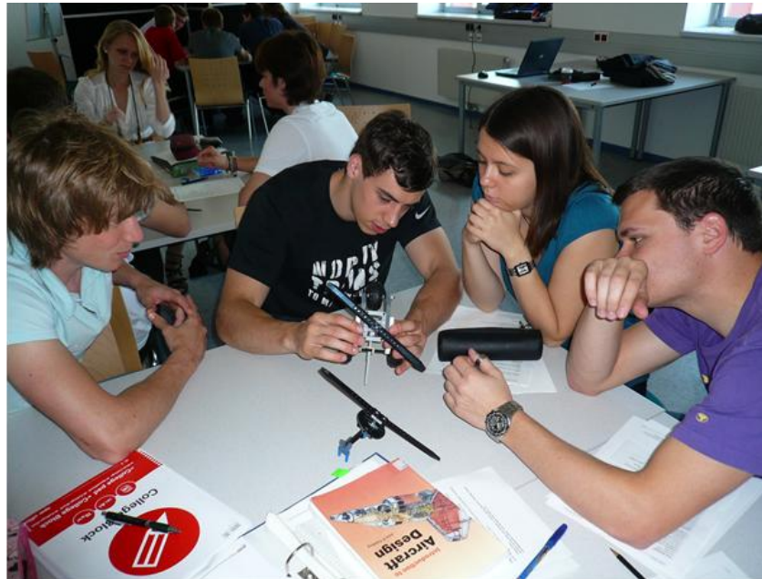
Figure 3: Students during the Discussion Phase Critically Examining Their LEGO® Technic Models

This phase was important for the consolidation of the vocabulary applied in the written abstracts and allowed for an expansion of technical terms by means of listening to explanations, reviewing design approaches and discussing critical issues. Students thus received the opportunity to describe their own models and ask questions or make suggestions about other teams' creations. Since this last phase of the task can be repeated as long as every student design team has matched up with every other team in class, oral practice and student talk time can be increased and the instructor receives additional flexibility concerning the question when to end the activity.