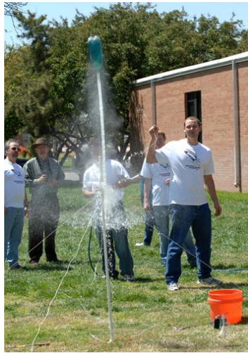
Figure 1: Rocket launch