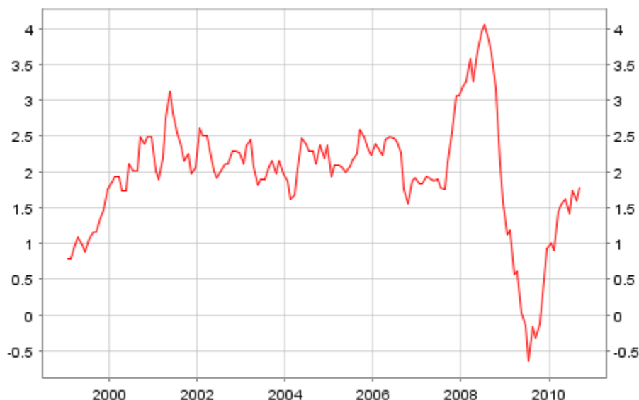
Chart 1: HICP 1999 – 2010