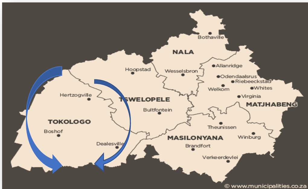
Figure 2. Map of the research setting

This study sourced the target population from all the informal contractors who resides and at the time of the study work as informal contractor as defined in the three rural municipalities of Boshof, Dealesville and Hertzogville. In total 300 informal contractors were earmarked to participate in the study.