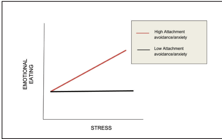
Figure 2. Expected interaction pattern between attachment styles and stress on emotional eating.

between the independent and dependent variable. In this study, attachment styles are conceptualized as the moderator, stress is conceptualized as the independent variable, and emotional eating is conceptualized as the dependent variable. It is hypothesized that attachment styles will affect the strength of the relationship.