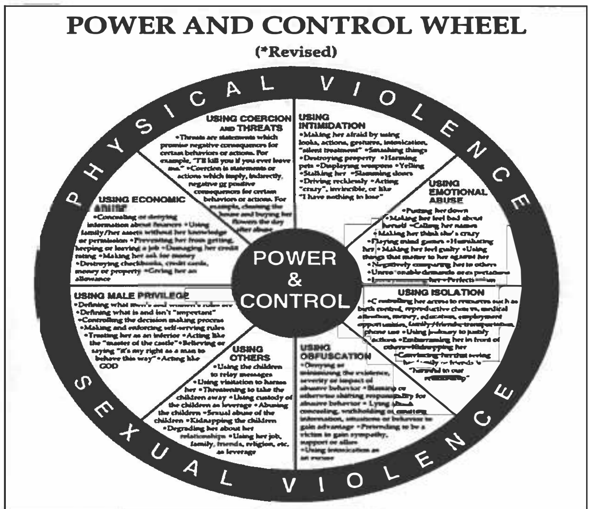
Figure 3: The Power and Control Wheel (Catholic Social Services).

Claims about the ineffectiveness of other interventions come from several studies, including Dunford's San Diego Navy Experiment, which concluded that batterer intervention programs are ineffective (Dunford, 2000). The study was designed to "evaluate the effectiveness of cognitive-behavioral interventions implemented in different treatment settings for men who batter" (Dunford, 2000, p.468). The study included had a control group, a men's group, a "conjoint and a rigorous monitoring" group. Dunford stated that, "[d]ata analyses revealed no significant differences between the experimental groups over a variety of outcome measures" (Dunford, 2000, p.468). Gondolf responded to the findings, claiming that the study is not