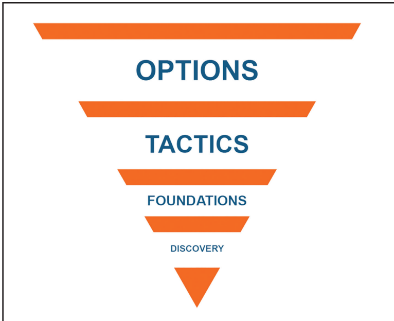
Figure 2: Four stages of the Alternatives to Domestic Aggression Program, based on the Duluth Model.