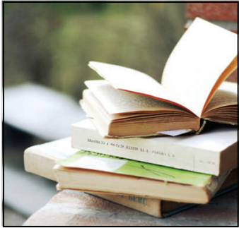
deviantART user, extrasist0le http://fav.me/d2kt1se