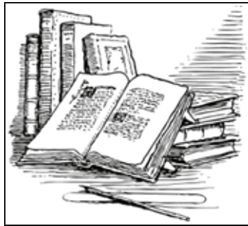
Open Clip Art user, johnny_automatic http://www.openclipart.org/detail/7361

This should be enough to get you started, but if you're interested in additional resources for finding graphics, visit http://userslib.com/2010/05/02/finding-images-for-print-web/