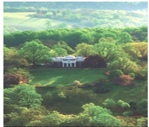
Left: Monticello in 1834 Right: Monticello in 2009