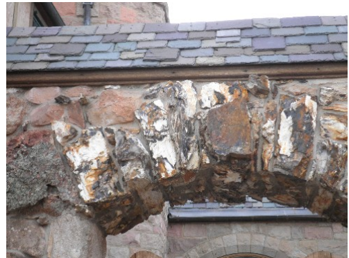
Cherokee Ranch (top and bottom left) and Cherokee Castle (top and bottom left).