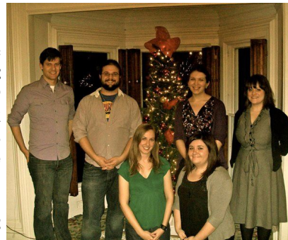
Members of the Preservation Eastern Board

Good luck to everyone as we finish working on final projects and exams, that big paper we should have started months ago, and some as they move on to graduate and enter the big bad real world. Preservation Eastern is wrapping up the semester with the Networking Mixer and Silent Auction, a few more socials and meetings, and the End of the Year Party on May 1, 2012 at the Ladies Literary Club. I hope to see you there!