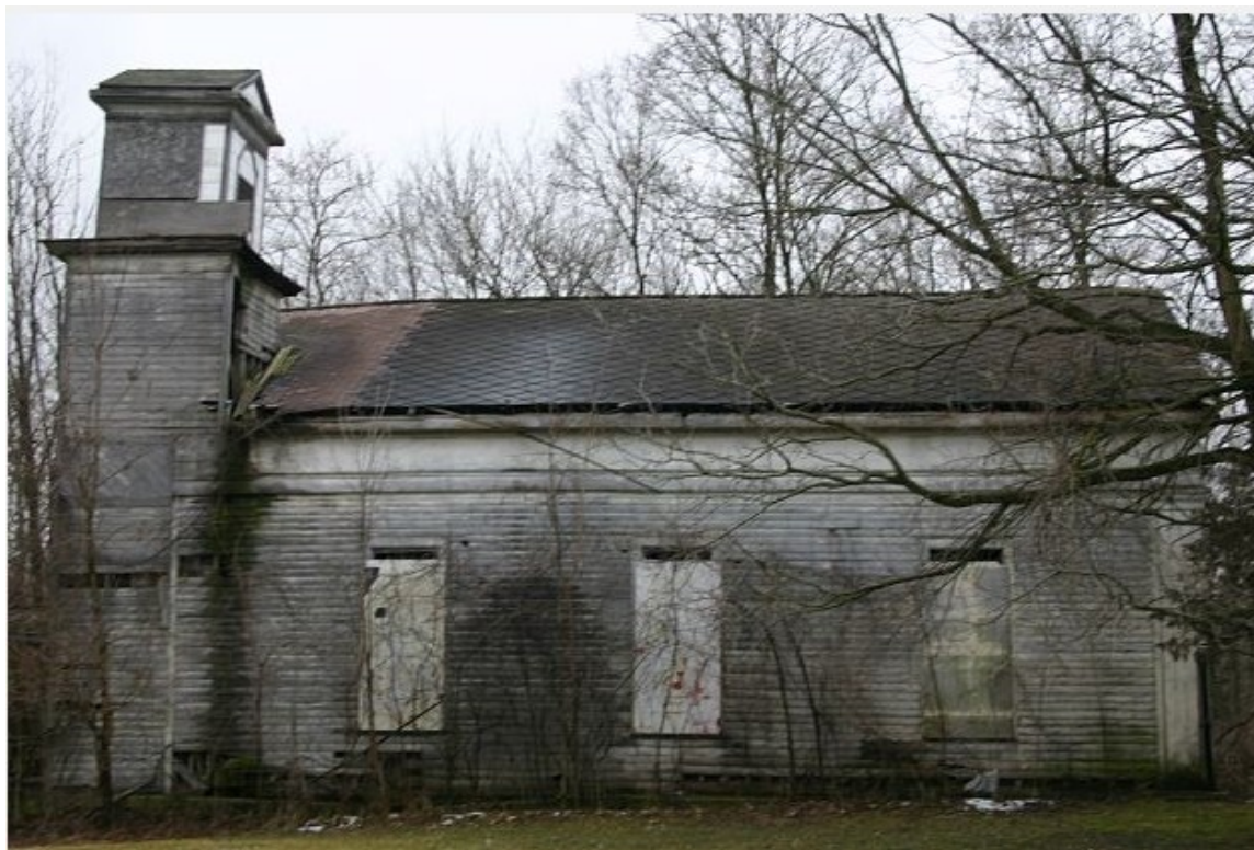
Elevation photo of Church