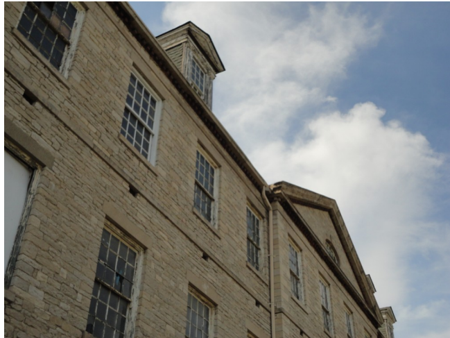
Exterior shot of Fort Wayne

The cultural landscape also has a deep and rich Native American history with importance to the Potawatomi and Chippewa people. One burial mound remains on the site, and it is believed that it contains some remains from other mounds that once