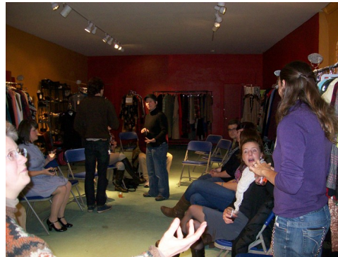
FOYF and PE members mingle at the Mix.