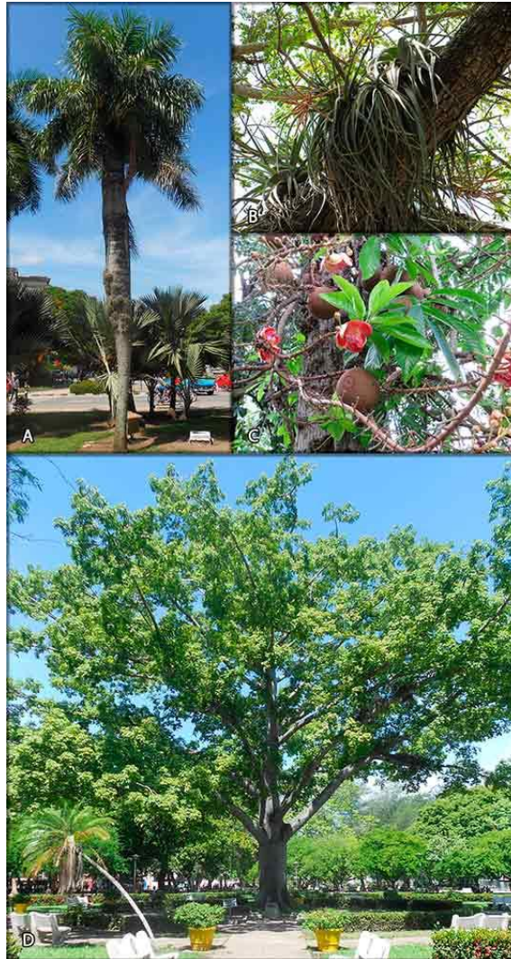
Fig. 4. Some plant species of the park. (A) Palm trees. On a second plane: Acrocomia crispa (with epiphytes of Tillandsia recurvata growing on the trunk); to the bottom and smaller: Latania loddigesii . (B) Tillandsia balbiana growing on branches of Samanea saman . (C) Couroupita guianensis . (D) Ceiba pentandra .

This study confirmed the existence of 198 species from 170 genera, and 72 families of Embryophytes (Fig. 4). Appendix 1 shows a complete relationship of all these systems, which include taxons introduced by man (67%) and others that grow spontaneously (33%)