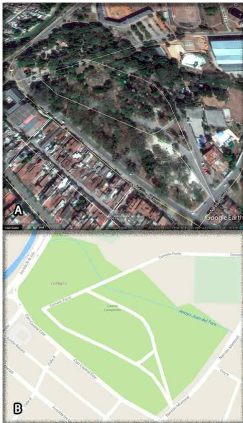
Fig. 2. Location and distribution of Casino Campestre. (A) Orthophoto (Google Earth < http://www >).

poles and garbage containers, 100 benches (most of them with a particular design that includes bronze carvings and the acronym of the park) (Fig. 3).