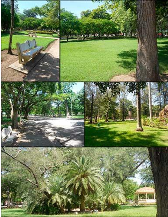
Fig. 5. View of vegetation in Casino Campestre, from different angles.

The floristic and physiognomic composition of the plant coverage described above