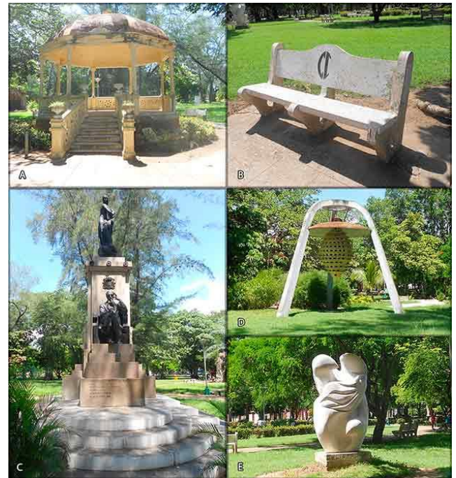
Fig. 3. Relevant architectonic elements of the park. (A) Pavilion. (B) Model of the current structures. (C) Monument to Salvador Cisneros Betancourt (1828-1914), Santa Lucía Marquee, president of the Republic on Arms twice, etc. (D) Monument in honor of the Literacy Campaign of 1961 (hive-like shelter for pigeons that reproduces the shape of lanterns used by the young teachers to light their classrooms). (E) Monolith of peace.

Relevant facilities adjacent Casino Campestre that complement the significance of the park. Plaza de la Revolución “Mayor General Ignacio Agramonte”, Provincial Assembly of the People’s Power, “Candido González” baseball stadium, “Rafael Fortún Chacón” Sports Palace, “Patricio Lumumba” Sports Center, “Casino Campestre” Recreational and Cultural Center, “Álvaro Morell Álvarez” High School, “Iván Hidalgo Funes” Auditorium.