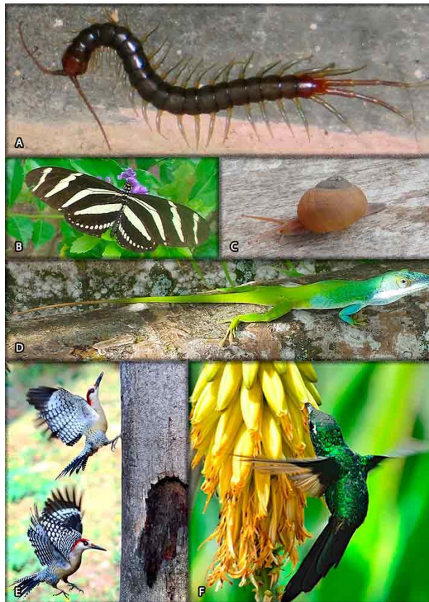
Fig. 6. Some animal species found in the park. (A) Scolopendra alternans. (B) Heliconius charithonia ramsdeni. (C) Zachrysia auricoma. (D) Anolis allisoni. (E) Melanerpes superciliaris. (F) Chlorostilbon ricordii.

mollusks ( Zachrysia auricoma ), daylight butterflies ( Anartia jatrophae guantanamo , Heliconius charithonia ramsdeni ), chilopoda ( Scolopendra alternans ), amphibians ( Eleutherodactylus planirostris ), reptiles ( Anolis allisoni ), and birds ( Chlorostilbon ricordii ). However, others, like bird Melanerpes superciliaris , whose habitat is in the forests, traditionally, have found shelter in the park and migrated to the city forced by the advance of deforestation (Fig. 6).