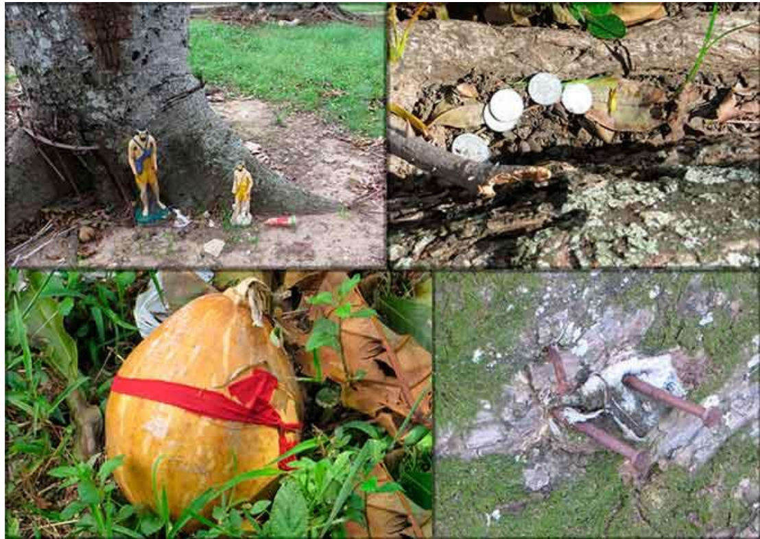
Fig. 7. Offerings related to Afro-Cuban religious rituals, placed by the trunks of Ceiba pentandra in Casino Campestre.