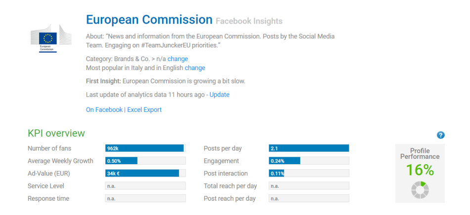
Figure 1. Key Indicators of the European Commission's Facebook page

The European Commission's Facebook page totals 962,000 fans, with a weekly average increase of 0.50%. At the same time, the European Commission's Social Media communication specialists post on average 2.1 times a day and the rate of engagement is 0.24%. On 1 January 2019, the European Commission numbered 880,000 fans, and in April 2019 it grew faster than in the past months when it surpassed the threshold of 920,000 fans, this increase continuing until July 1, 2019, when the number of fans reached 920,000.