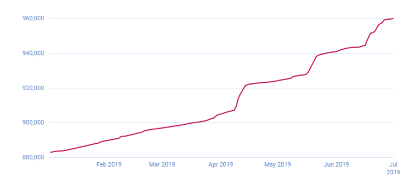
Figure 2. Evolution of the Number of fans of the Facebook page of the European Commission (1 January 2019 - 1 July 2019)

During the monitored period, January 1, 2019 - July 1, 2019, 413 posts were published and photos were the most frequent (51.3%), followed by video posts (41.2%), links (5.8%), and statuses (1.7%).