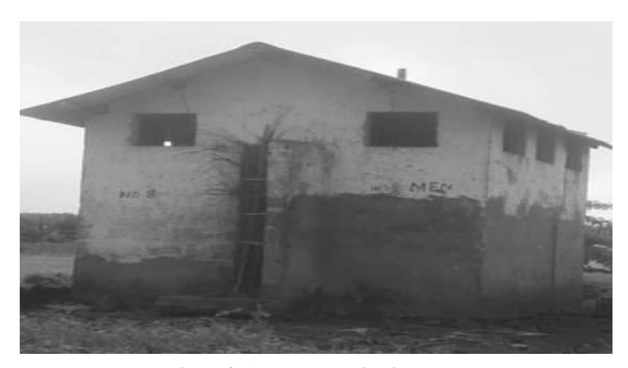
Figure 3. Abandoned Toilet in Ekona

Empirical evidence reveals that the toilet facilities available to plantation worker leave very much to be desired. The residential areas are divided into camps and each of these camps has more than 50 homes. The toilet situation has really been very bad as the areas continue to use very dirty and poorly constructed as well as highly inadequate toilets (Figure 3). These toilets are exposed, some are without doors and a situation very much akin to the "tragedy of the Commons" operate here. That is, a common service which is available to all and owed by none is always misused and abused.