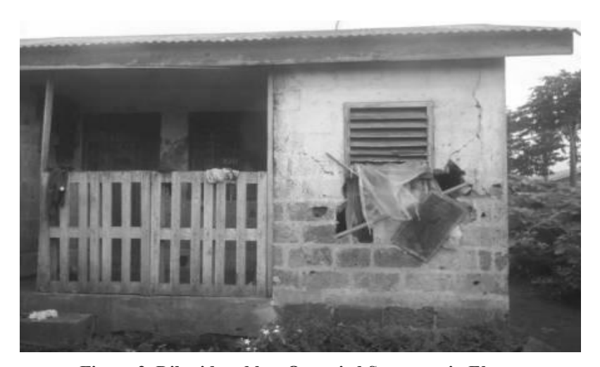
Figure 2. Dilapidated but Occupied Structure in Ekona

As far as housing is concerned, most of the sampled CDC residential quarters (camps) are characterised by a huge population of unskilled workers who live in slums characterised by poor living conditions-crime and violence, poor housing conditions, poor health and sanitary conditions, and waste disposal problems among others. This problem becomes onerous when we discover that the population of these groups of people is increasing and the authorities are yet to make provisions for infrastructural expansion to accommodate the teeming population. The structures are fast deteriorating. Field reports disclosed that effective refurbishment of these settlement camps had stopped since the 1980s and till date, these houses have not only faced pressure and deterioration, but they have been virtually neglected by the powers that be (Figure 2).