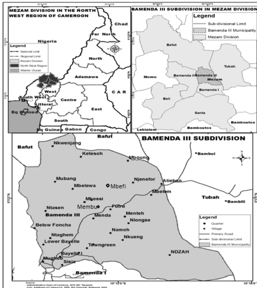
Figure 1. Location Map Bamenda III