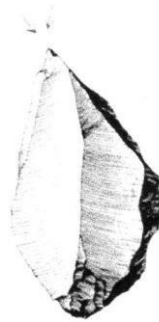
Figure 4. Stikle. Purpose Unknown. From Approx. 10,000 BC

Characteristic finds from the Bromme Culture are (the word has two forms): stikkel(er) —sharpened flint flake(s) from the Neolithic period (DFO) stikle(r) —pointed instrument(s) or tool(s) (LL18, 100). No tools of bone have been preserved at the site of the culture (LL3,41).