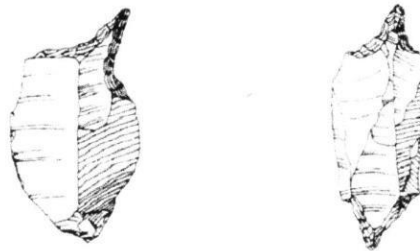
Figure 3. Zinken. Purpose Unknown. From Approx. 20,000BC

A special characteristic of the Hamburg Culture was the “Zinken”, a small flake the size of a thumb.